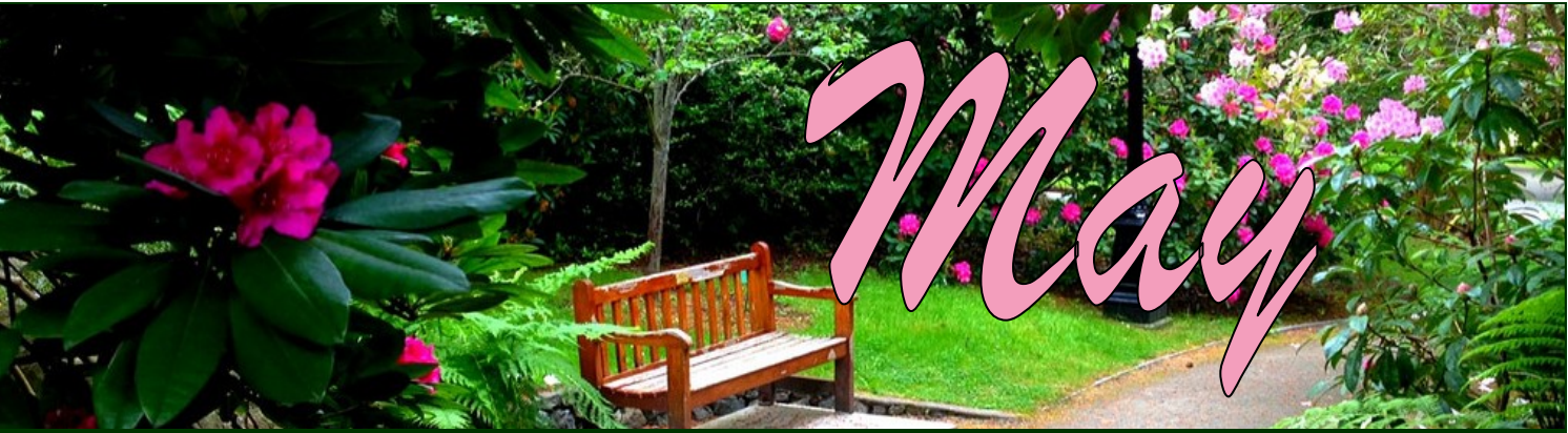
Alton United Methodist Church

U.S. Permit Paid Non-Profit Organization Permit #78 Thayer, MO. 65791